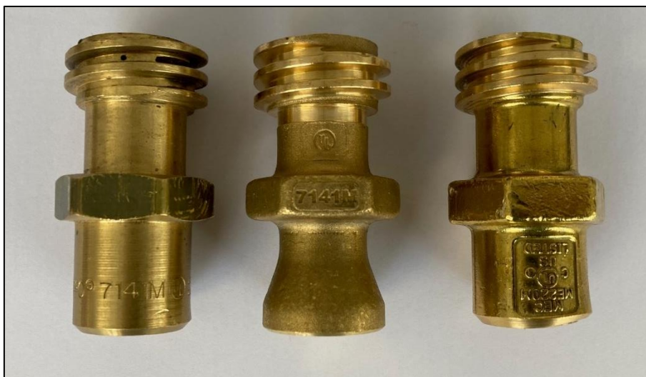
Fig 1. “Old” Rego 7141M, “New” Rego 7141M, MEC220M

Either the “new” Rego 7141M or the MEC220M part may be supplied under the part number CH-7141-0002.