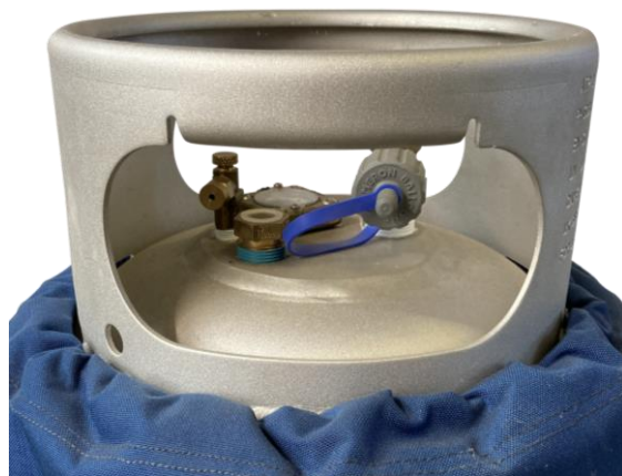
CB2990 Issue A cylinder (withdrawn)