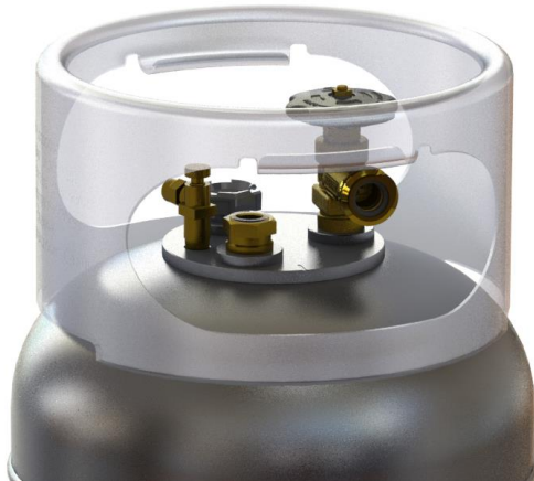
CB2990 Issue B cylinder

Cylinder Valve Plate: The cylinder valve plate of the CB2990 Issue B cylinder is raised above the dished end of the cylinder and has raised valve bosses. The Issue A cylinder valve plate has a flat top and is welded flush with the dished end.